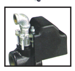
MODULATING COOLING VALVE (VT-275-LX MODEL ONLY)

VT Series Mold Temperature Controllers are used to process temperature control to 250°F. These units use an incoloy heater and centrifugal pump with standard NPT process fittings. Each unit has stainless steel cabinetry with a galvanized steel base mounted on casters. Two levels of microprocessor instructions are available. The LS Series offers To process temperature display and pulsed cooling valve. The LX Series offers To and From process temperature display with a modulating cooling valve. Both models come standard with process pressure gauges and a 10-foot power cord.