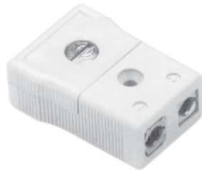
Standard Jack (Female)