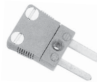
Mini Plug (Male)