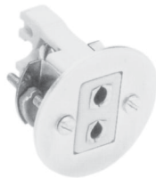
Standard Round Panel Jack