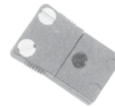
Mini Jack (Female)