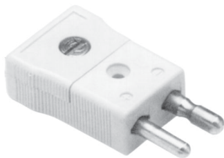
Standard Plug (Male)