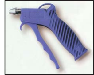
Safety Hi-Volume Model: AL-13 $9.85

Body: Hostaform C Nozzle: Model "L" Brass Valve: Brass Spring: Stainless Steel Seals: Buna-N Inlet Port: 1/4" Female NPT Outlet Port: 1/8" Female NPT