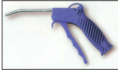
Safety Blind-Hole Model: AK-13 $10.40