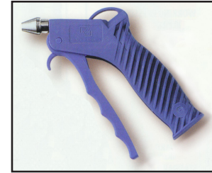
Safety Hi-Volume Model: AL-13

Body: Hostaform C Nozzle: Model "L" Brass Valve: Brass Spring: Stainless Steel Seals: Buna-N Inlet Port: 1/4" Female NPT Outlet Port: 1/8" Female NPT