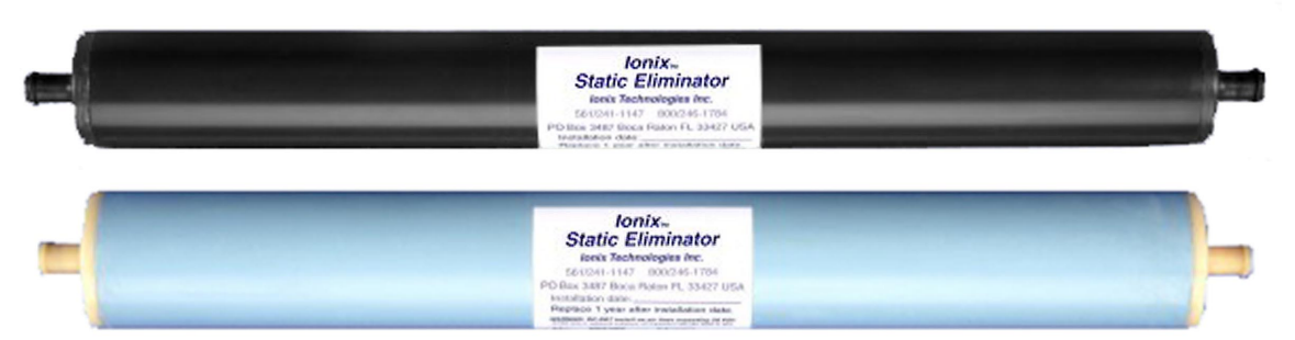
Top: PL300-2, Bottom: HPPL300-2

No Equipment Modification No nuclear or electrical wiring Rugged for shop floor use Makes perfect finish when painting plastic