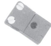
Mini Jack (Female)