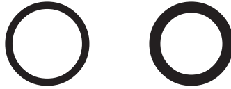
Widths: 1/16" 3/32"

If you use large quantities, let us quote discounted volume pricing!