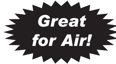
Double Outlet Manifold